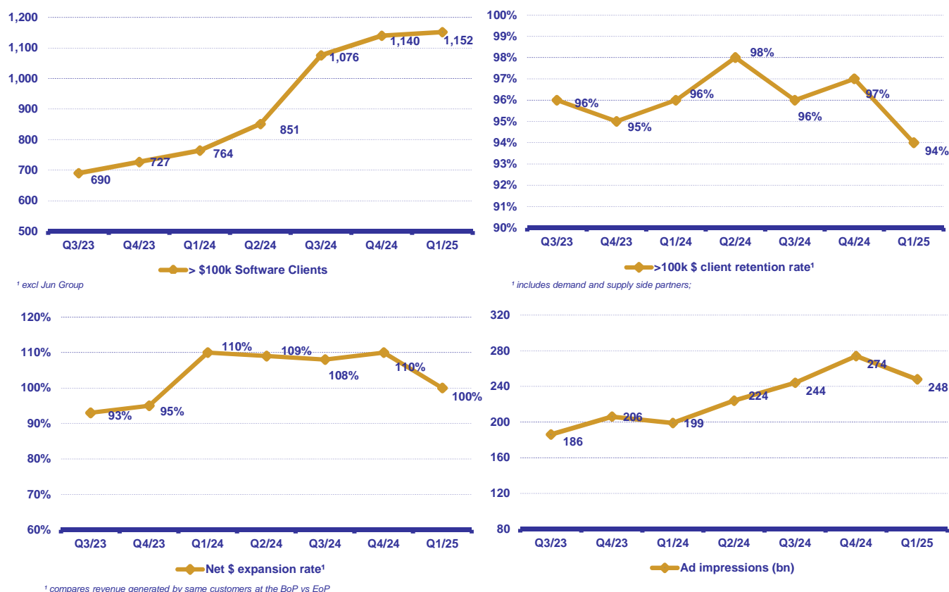
Figure 2: Q1 key performance indicators